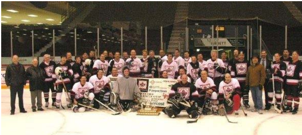
7th East/West Hockey Challenge Players and Coaches

The 7th East/West Hockey Challenge took place following the Technical Sessions on the Tuesday evening, January 23rd. Hockey enthusiasts from near and far squared off to play for the coveted Kilborn Cup at the Ottawa Civic Centre. After almost two hours of very fast and exiting hockey, the game ended in the East edging out the West and retaining the title with a score of 4-3.