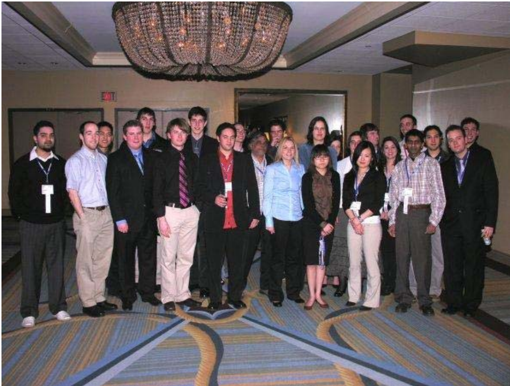
CMP 2007 Sponsored Students