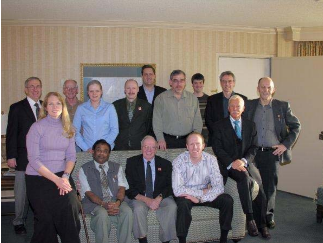
CMP Executive 2006/2007